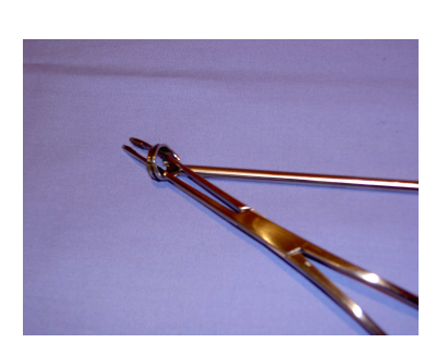
Illustration: banding int haemorrhoids

⇒ You should seek medical advice on the above number